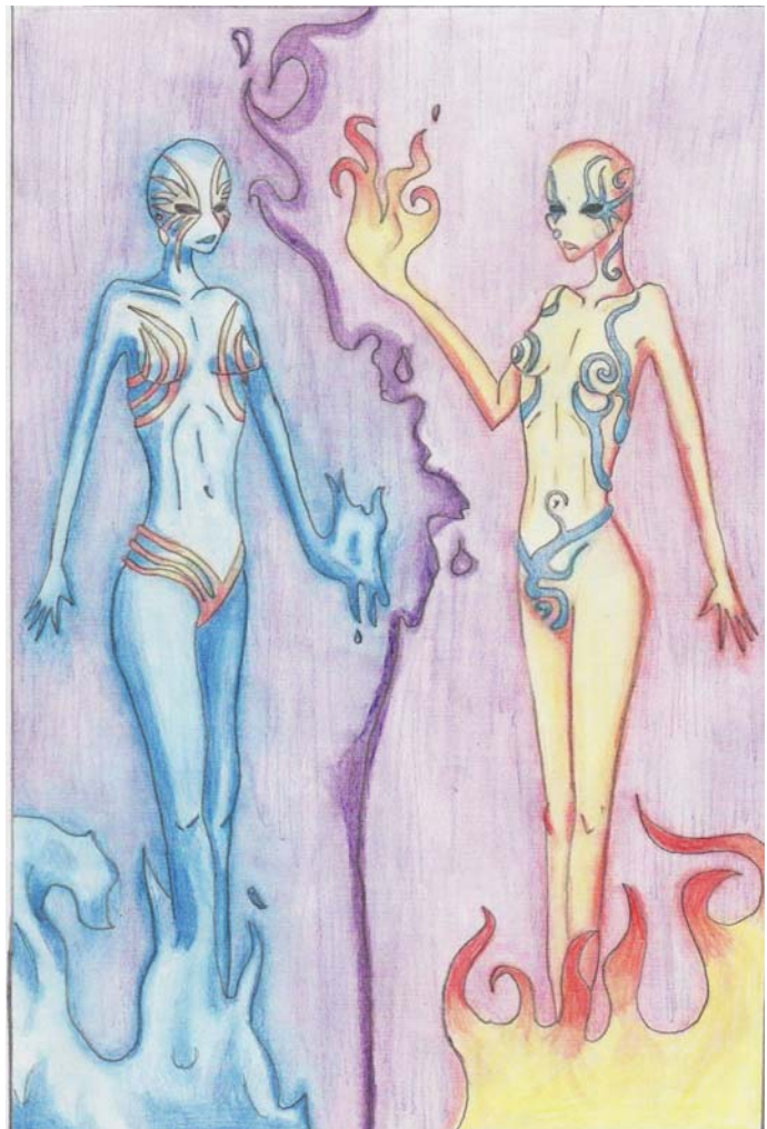
Knapton News February/March 2010 The butterfly featured in the Pigneys Wood article was a 'Five Spot Burnet'

Tuesday 23 March at approximately 11:15 a.m.