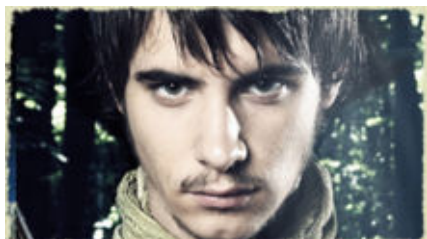
Harry Lloyd as Will Scarlett

Here is a short biography of Harry Lloyd: