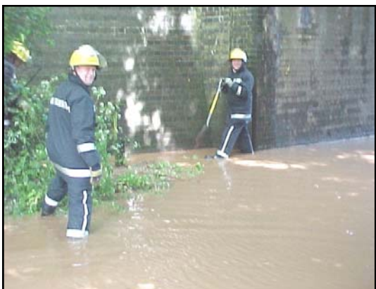
Flooding under the railway bridge - June 2007

from the very bad weather, coupled with appeals from local residents, has prompted Norfolk County Council Highways Department to investigate the situation.