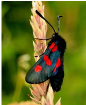
Can you name this unusual creature? Answer in next edition of K News

In addition the Trust are also pleased to report that they gained the 'Site Award' from the Norfolk Biodiversity Partnership Communities and Nature Topic Group 'for its outstanding conservation and management work at Pigneys Wood'. The award was made at the Community Biodiversity Awards 2008 ceremony held in Norwich last year. The site award is the highest award available in this category.