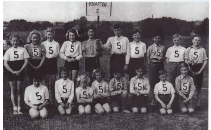
Knapton Sports Team at North Walsham 1949